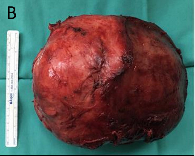
Figure 2. En-bloc resection of the tumour was performed (A); the gross specimen of the complete resection of a fairly circumscribed tumour with a smooth surface measuring 20 \times 15 \times 12 mm and weighing 2 kg (B).

150 \times 120 mm, weighing 2 kg with a homogenous greyish surface on the cut section (Figure 2b). Microscopic examination of the resected specimen showed interlacing fascicles of uniform spindle cells set in the background of the stroma. The circumferential margin is free from the tumour cells. No nuclear atypia and mitosis are seen. Immunohistochemically, the neoplastic spindle cells are negative toward smooth muscle actin (SMA), Desmin, CD34, and S100.