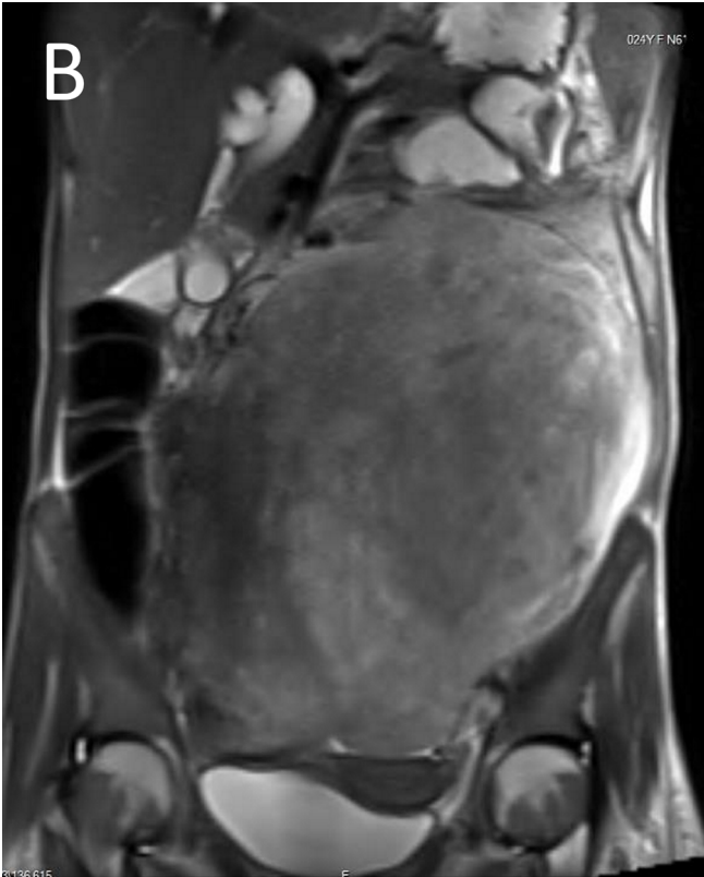
Figure 1. The MRI in axial (A) and coronal (B) view revealed a large abdominal mass pushing the bowel loops to the sides and above, posteriorly compressing the abdominal aorta, the lower part of inferior vena cava, and both ureters causing bilateral hydroureteronephrosis.

Her general condition gradually improved over 2 weeks. An exploratory laparotomy and tumour excision were then carried out due to the compressive nature of the large tumour. The tumour measured 20 \times 20 cm and was noted to arise from the small bowel mesentery close to the ileoanal pouch. En-bloc resection of the tumour with an end ileostomy was performed (Figure 2a). The patient was nursed and closely monitored in the intensive care unit. She had an uneventful postoperative recovery and was discharged well 10 days later. The histopathology examination revealed a macroscopically fairly circumscribed tumour measuring 200 \times